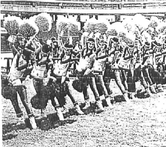
Here are the Redskinettes all decked out in their Indian garb and carrying Burgundy and Gold war-poms. The girls were THE entertainment hit in their debut last Sunday